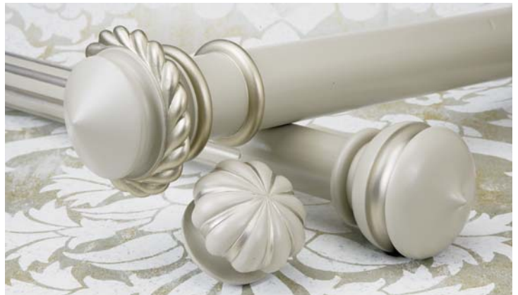
Palazzo finial (left) and Quattro finial (right) with a Parasol finial (from elsewhere in the range) all shown in silver gilt and grey

The Venetian Gilt finish is a silver gilt over soft taupe. Its aged and distressed qualities reminiscent of faded opulence typified by many Venetian interiors contrasting old wealth with new. It works well with fabrics in soft greys and silvers, fine patterned silks and stark minimal stripes.