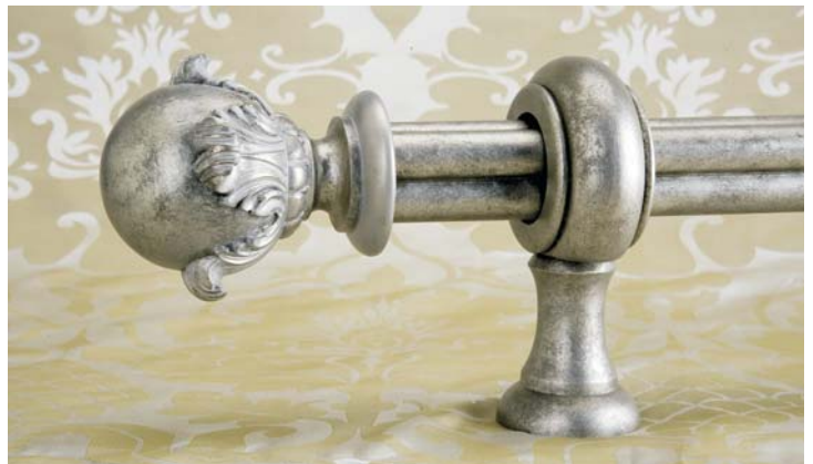
Padua finial shown in Venetian Gilt with Gothic pole and Gothic bracket